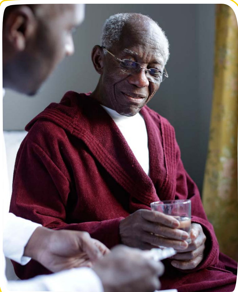
Layton Thompson/Marie Curie

Carers may particularly struggle when preparing a home for a loved one to die in. The physical transformations needed to turn a home into a site of care can take an emotional toll on carers 29 .