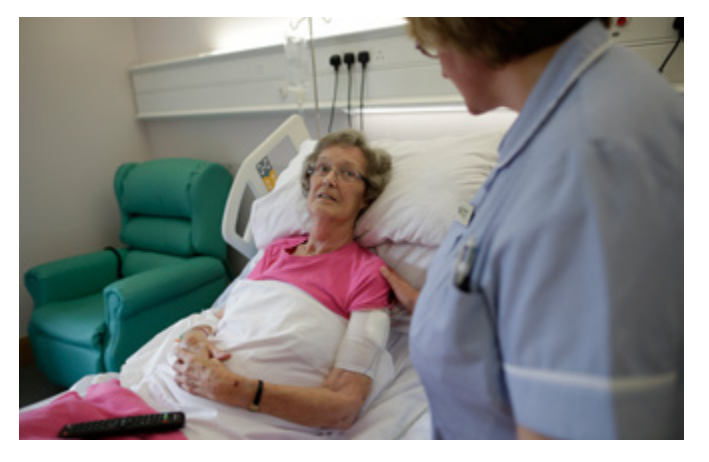
Patient and nurse at Marie Curie Hospice, Belfast